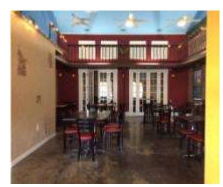
A peek at the new interior!

This month we're returning to The Happy Cajun on Sunday, April 13<sup>th</sup> which has been remodeled again and promises to be an enjoyable gathering. They are located at 50055 Texas 289 in Pottsboro. Our reservation is for 12:45 PM. Out To Lunch is our informal once-a-month (with some hiccups) gathering where we go to a local restaurant, enjoy good food, company and fellowship. We each pay our own fare. If you haven't come along, why not give it a try this month?