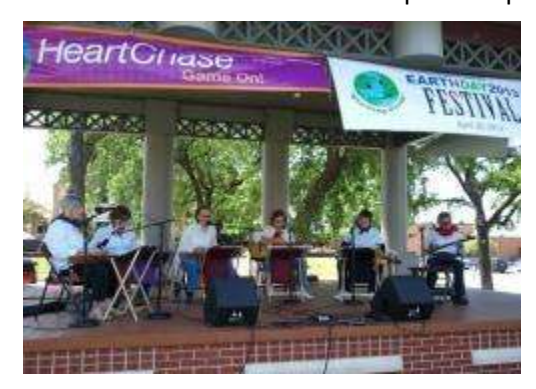
Saturday April 26<sup>th</sup> 8:30 - 5:00

Everyone can do something, please come and be part of this wonderful outreach project of our tiny congregation!